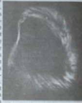
Mystery visual in sun in Life Magazine, May 1954

Continued from page 1 holding it sideways and not realizing what they were looking at, because that is the way the photo was in the magazine. But when you take this picture here and turn it on its side, you can clearly see a certain shape in the picture. It is a face.