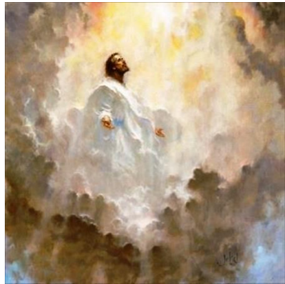
The ascension of Jesus

We need to examine verse 5 , and be sure we get it placed right. “And she (Israel) brought forth a man child, (Jesus) who was to rule all nations with a rod of iron: (In the Millennium) and her child (The resurrected Jesus the Christ) was caught up unto God, and to His (The Father's) throne;” and that is where He still is this very hour. Why was He caught up? It was because the political element, that religious element that thought they knew everything that was to be known in that hour, CRUCIFIED HIM ; not even knowing He was the ONE all their scrolls had been pointing them to. Just think of it, those Pharisees and Saducees had been going to their various synagogues, reading the scrolls of the prophets, and going through their little rituals every Sabbath day. What were they reading? The promises of their Messiah that was to come. There He came, and they did not know one thing about Him. I just have to say this, Denominational Gentile churches are doing the same thing, looking for, and talking about a