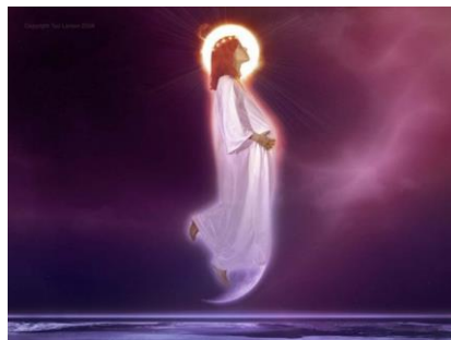
Revelation 12, Woman With Child clothed in the sun with the moon under her feet, representing the nation of Israel

THE WOMAN OF REVELATION 12:1, HAS BEEN ONE OF THE GREAT MYSTERIES OF THE BIBLE; AS FAR AS THE GENTILE CHURCH WORLD IS CONCERNED. THEY HAVE CALLED HER EVERYTHING EXCEPT WHAT, OR WHO SHE REALLY IS. NATURALLY HER TRUE IDENTITY IS SEEN THROUGH EYES THAT HAVE BEEN ENLIGHTENED BY THE HOLY SPIRIT; BUT ONCE YOU SEE IT, EVERYTHING FITS PERFECTLY IN PLACE, AS YOU READ THE FOLLOWING VERSES. THAT OF COURSE, IS ANOTHER