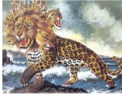
Beast with Seven Heads

Saints, I want to direct your attention to something I had never noticed the significance of, until I was studying for this message the other day. Many times we just read scriptures, and skim right over certain words, without ever seeing what is right there in plain view. We see the words, but we do not see the picture portrayed in the words. Remember, we are reading about the Roman Empire. I will read this little portion again. (part of Rev. 12:3) “Having seven heads and ten horns, and seven crowns upon his heads.” Can you see the little crowns on those heads? Those have to signify something. I had the crowns left off of the horns; because it would be so small you could not see them anyway. Just imagine though, on each horn sticking up there, John saw a little crown. I want you to realize, If that is the Roman Empire portrayed in this heavenly profile, we need to look a little deeper into the description. Therefore I want to take you to Revelation 13:1 , and notice where the emphasis is placed. “ And I stood upon the sand of the sea, and saw a beast rise up out of the sea, having seven heads and ten horns, and