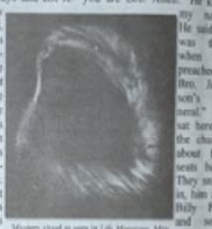
Mystery man in 1983 Magazine May 17, 1983